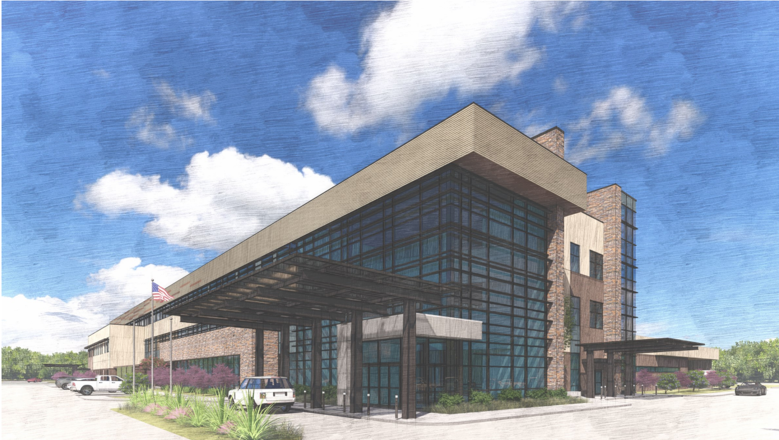
Planned Sherman Hospital Rendering