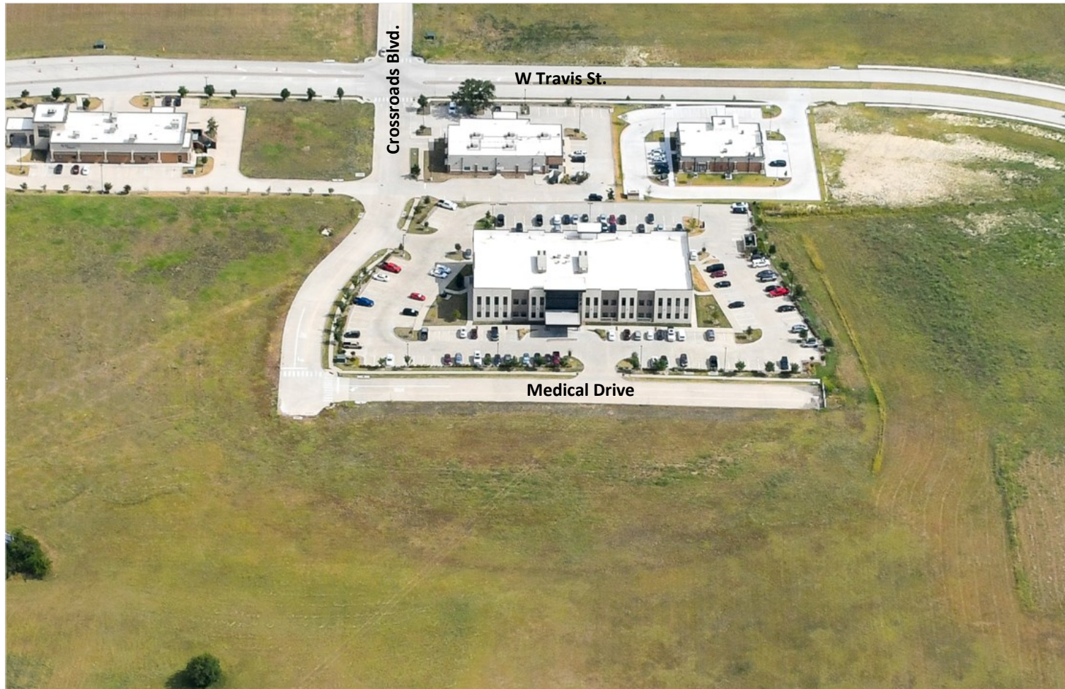
Completed MOB, DaVita, ER and Imaging Center